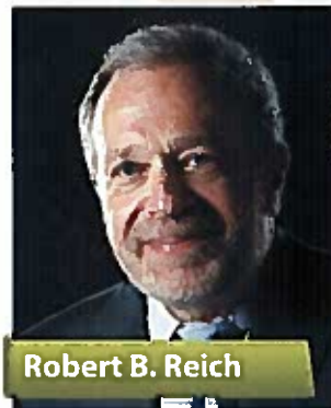
Robert B. Reich

Canadian Olympian Sponsored by Borden Ladner Gervais