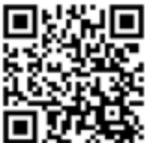
INTERNATIONAL STUDENT SERVICES

Follow ISS Fleming on Facebook for important messages and to connect with other International students. Feel free to connect in person with ISS in Peterborough, Room C 2 100 or Frost, Room 201H .