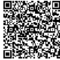
INTERNATIONAL STUDENT ORIENTATION