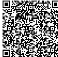
BOOK AN APPOINTMENT WITH US