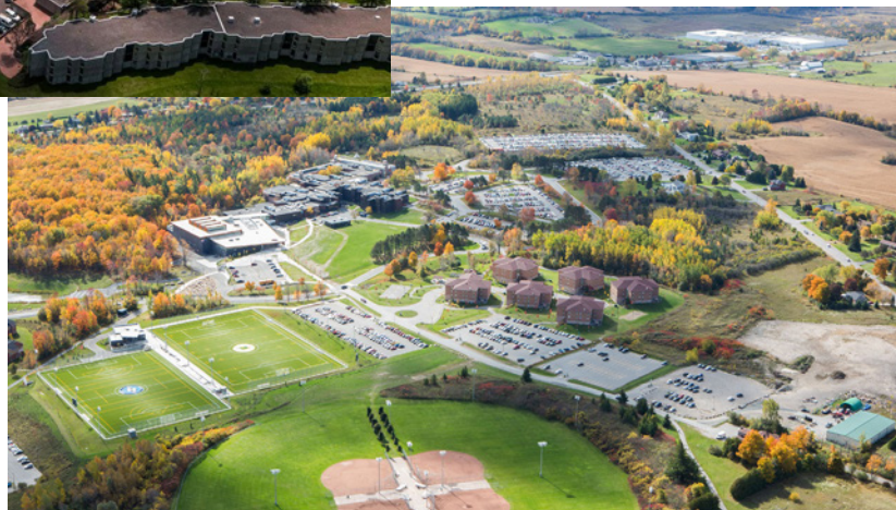
Fleming Campus ▶