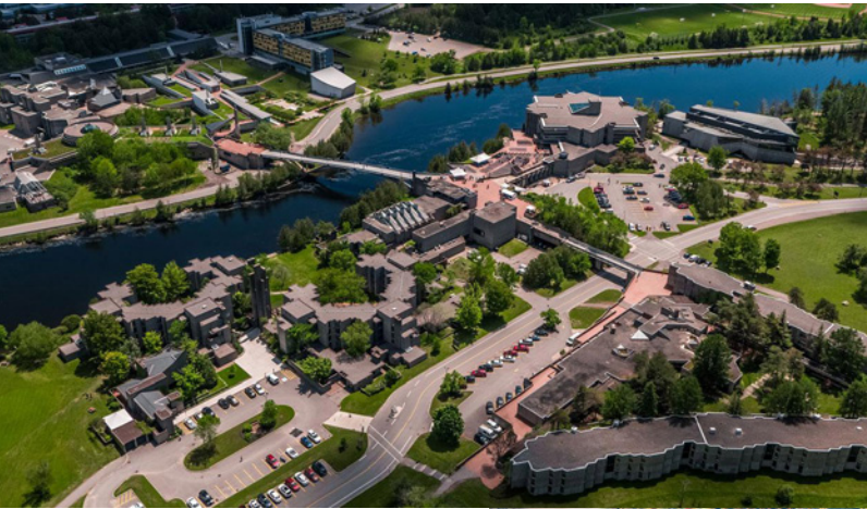
◀ Trent Campus

The Fleming College Career Services team and Trent University CareerSpace can help you explore career options by identifying your skills, values and interests, getting information about the labour market, and researching related college programs. They will also help you with the process of applying for jobs, including critiquing a resume and cover letter and advise you on Networking strategies and Interview preparation.