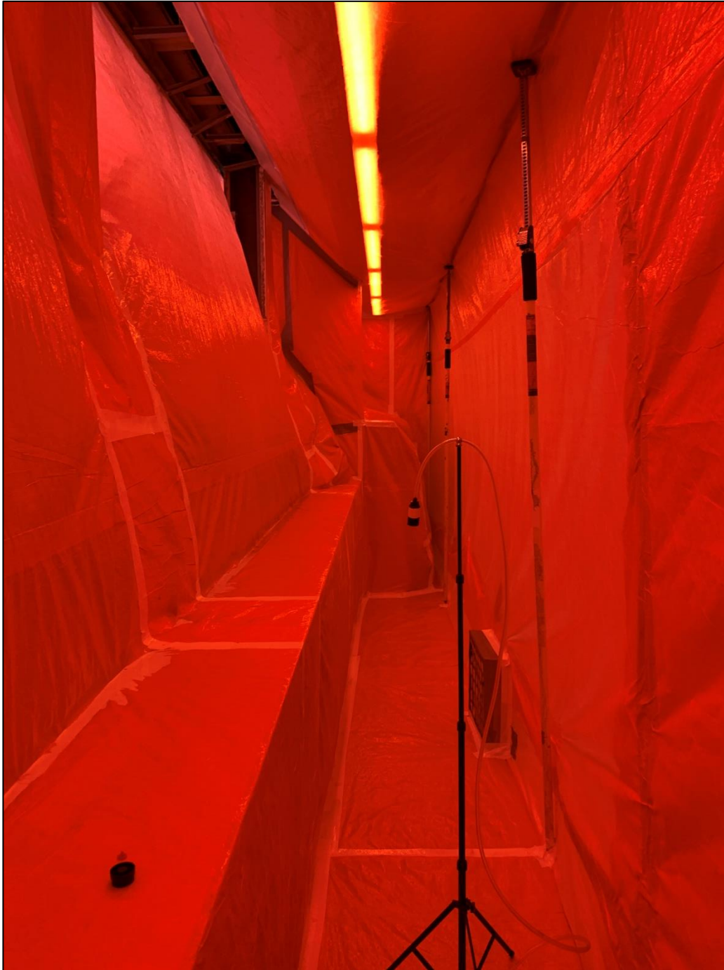
Photograph 2: View of the enclosure set up by A&O personnel.